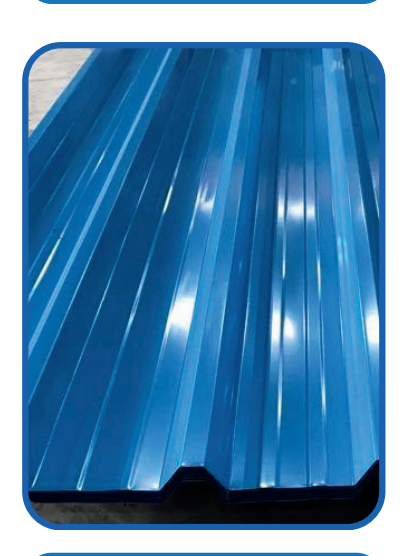
PPGI COLOUR COATED SHEETS