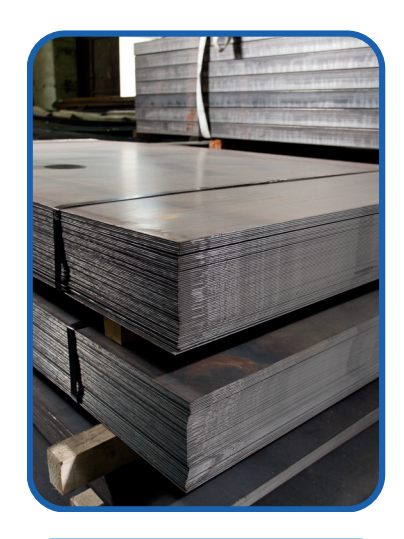
H.R. SHEET/ PLATES