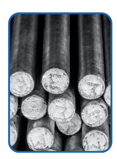
M.S. ROUND BARS