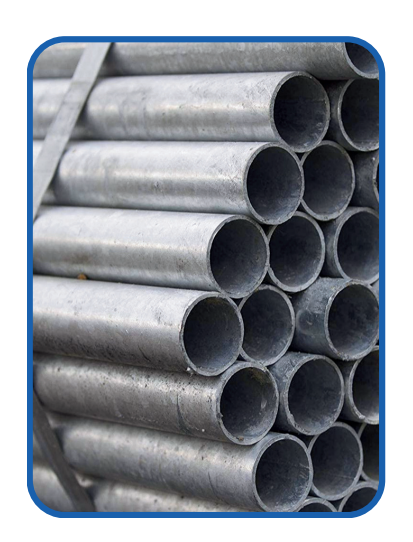
M.S. ERW ROUND PIPES