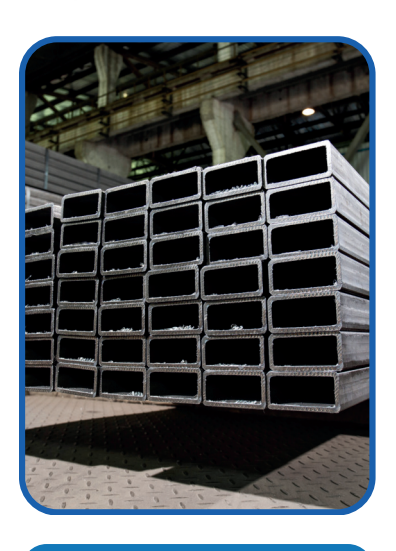
M.S. RECTANGULAR TUBE